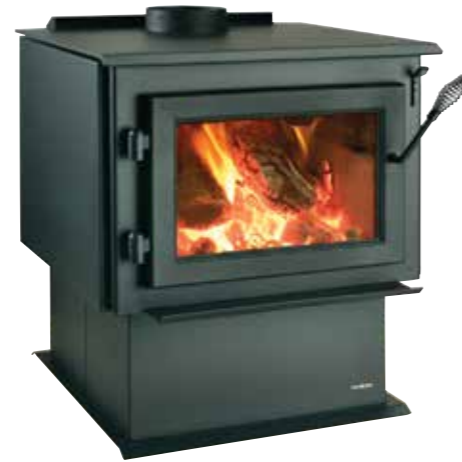
WS18 wood-burning stove

Manufactured in the USA, by the world's leading hearth company since 1927—known for value and dependability.