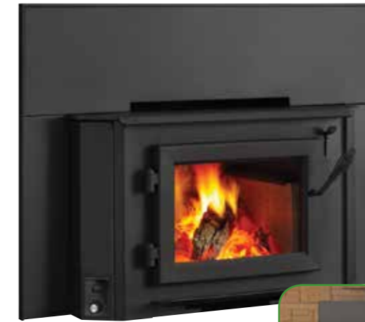
WINS18 wood-burning insert