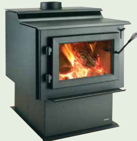
WS22 wood-burning stove