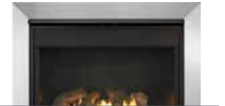
TRIM KIT Available in three or four-sided kits in black or stainless steel.