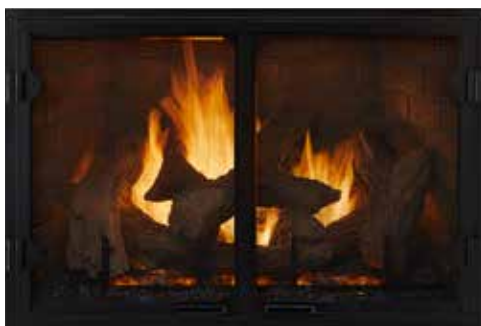
BLACK GRAND VISTA SCREEN DOORS