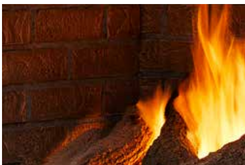
TRADITIONAL BRICK INTERIOR PANELS