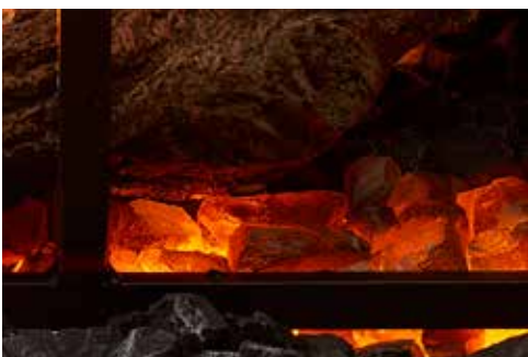
GLOWING LED EMBER BED