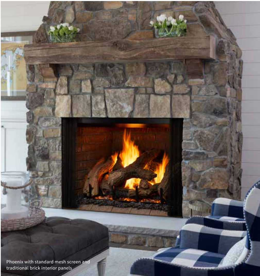
Phoenix with standard mesh screen and traditional brick interior panels