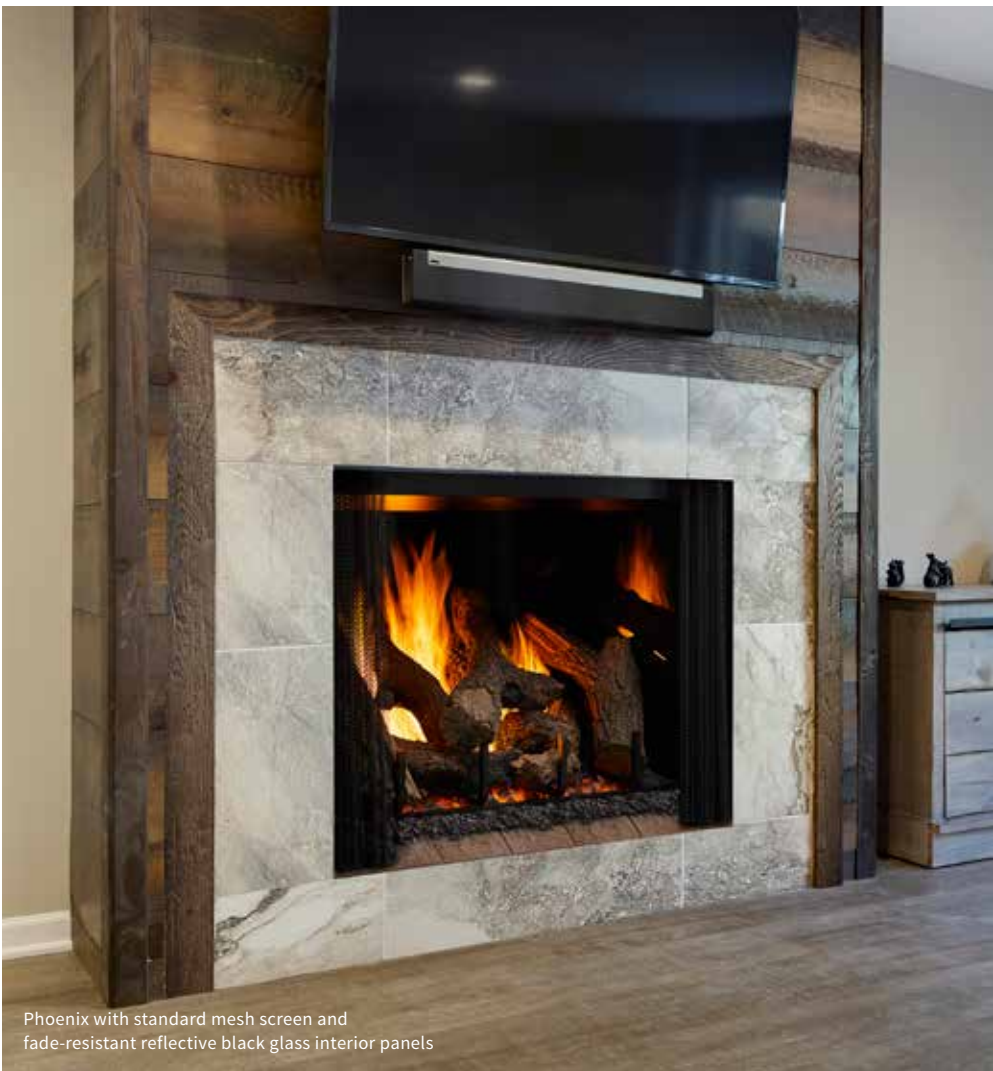
Phoenix with standard mesh screen and fade-resistant reflective black glass interior panels