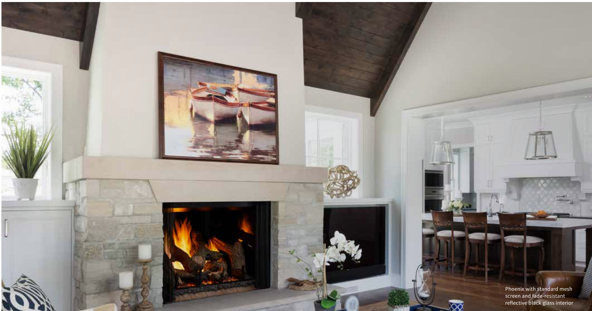
Phoenix with standard mesh screen and fade-resistant reflective black glass interior