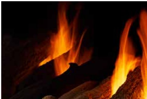
FADE-RESISTANT REFLECTIVE BLACK GLASS INTERIOR PANELS