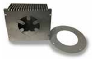
Outside Air Termination Cap