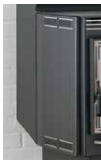
Matte Black with Stainless Steel accent