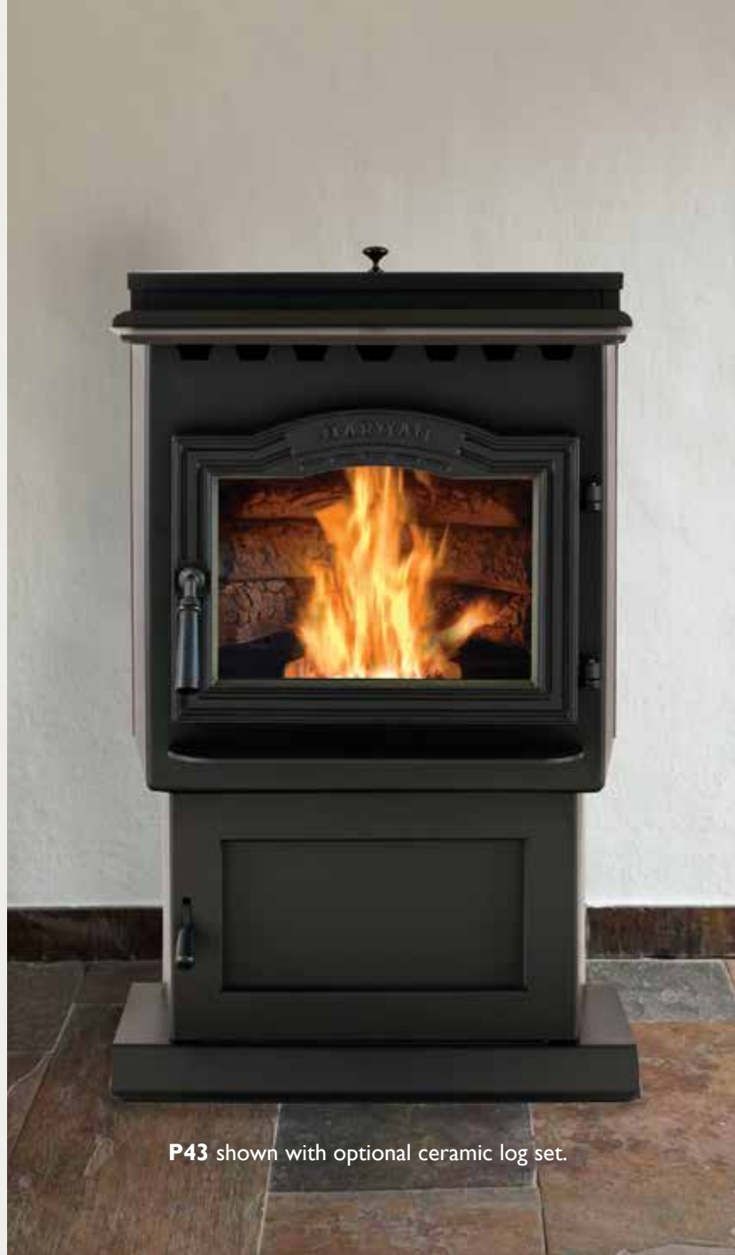
P43 shown with optional ceramic log set.

PelletPro™ Technology This patented system makes it possible to burn any grade of pellet fuel with maximum heat and efficiency. A bottom-up feed system burns each pellet completely and allows for 24-hour heating.