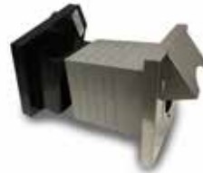
Direct Vent Wall Pass-Through