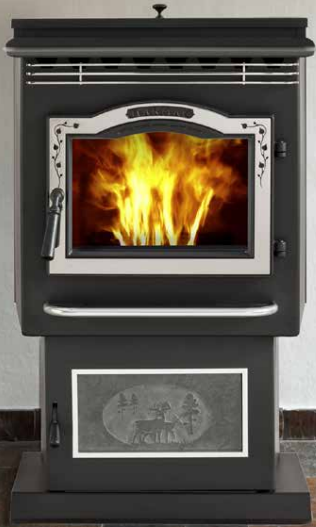
P61 shown with optional leaf door trim, air grille and deer slate inlay.