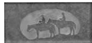
Trail Riders Slate