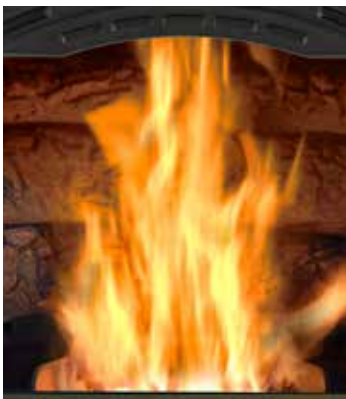
Ceramic Log Kit