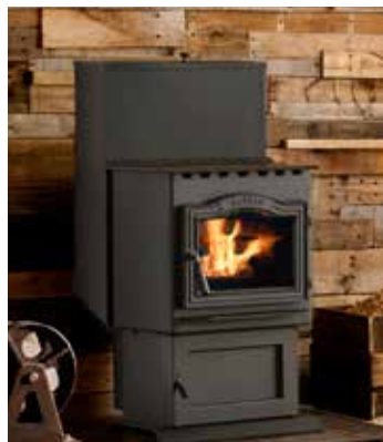
55lb hopper extension (P43) 60lb hopper extension (P61 & P68)