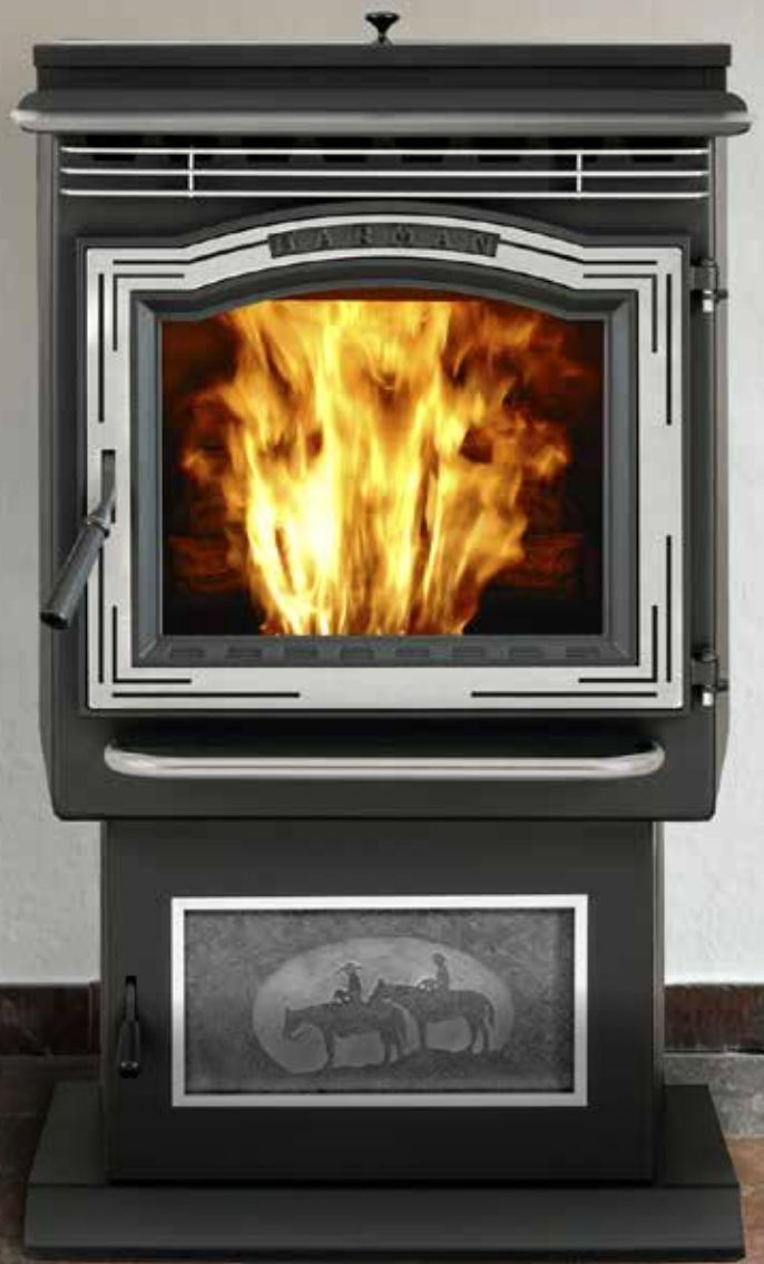
P68 shown with optional modern door trim, air grille, trail riders slate inlay and log set.

heat shields with brushed stainless accent and log set.